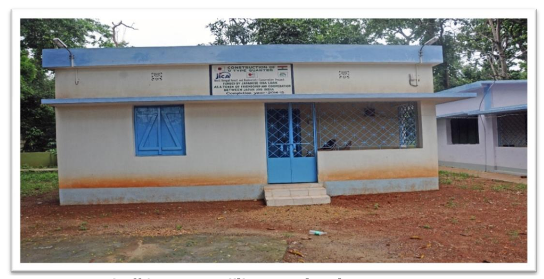
Staff Quarter at Hijli FMU under Kharagpur DMU

Civil works relating to vertical extension of Aranya Bhawan, Salt Lake, Kolkata in two floors have been completed by 2017-18. Now process for installation of 3 elevators is under process.