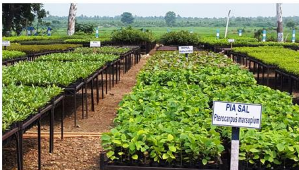
ADURIA CENTRAL NURSEY, BURDWAN DMU