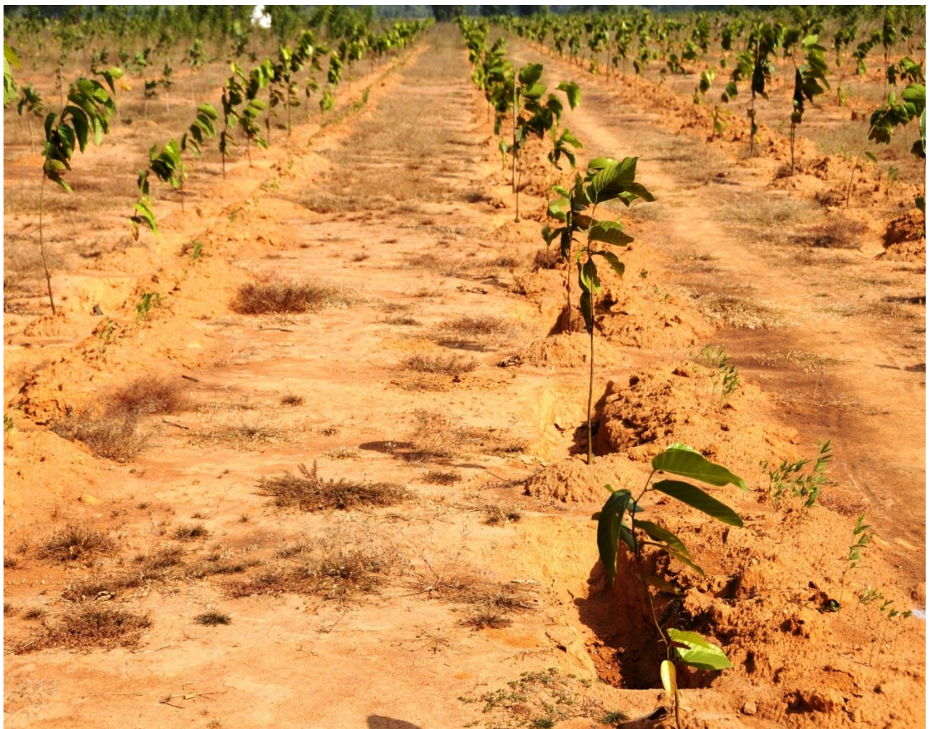
Kesuaria, Kharagpur, Hizli, A2 2014