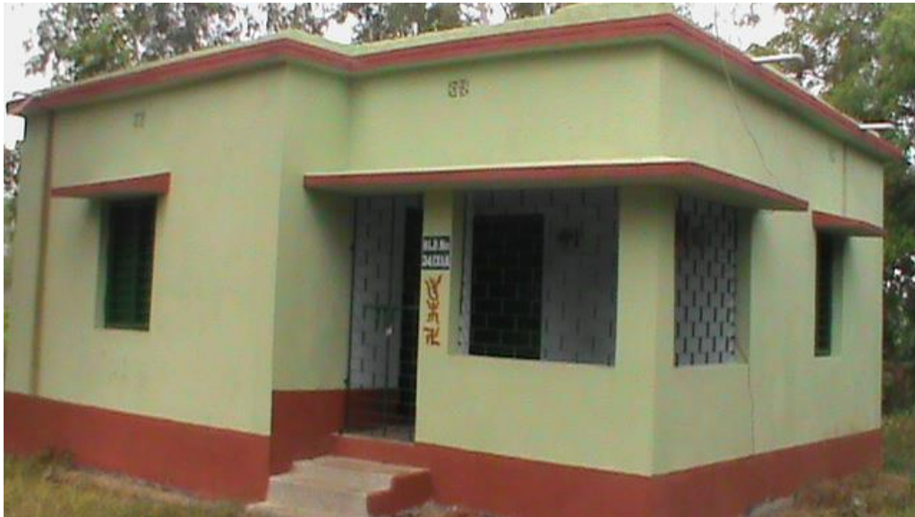
Chandrakona FMU Andharnayan Beat Group D

The construction of buildings for field staff is also under progress. Till end of October, 2014, 5 no. Group D quarters, 2 nos. group C quarters and 1 nos. ROs quarters/Range offices were completed.