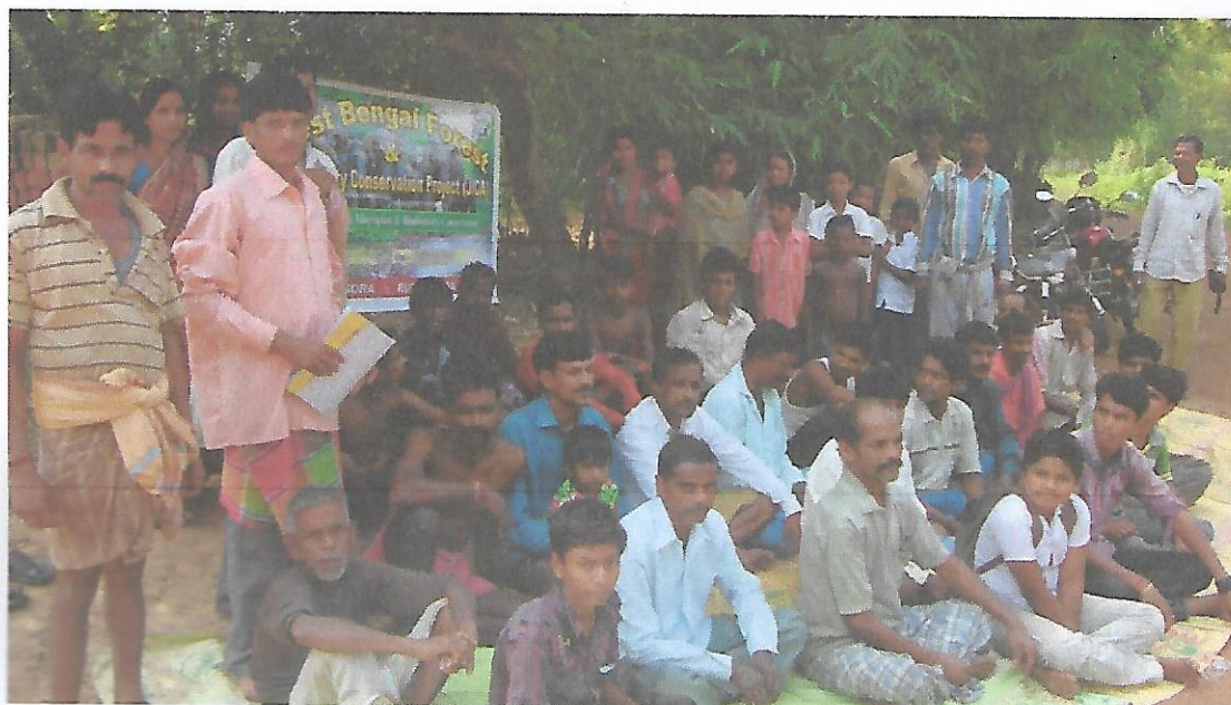
Training of FPC members on Microplanning at Hizli

Drafts for about 20 micro-plans were received till March 31 st March, 2014.