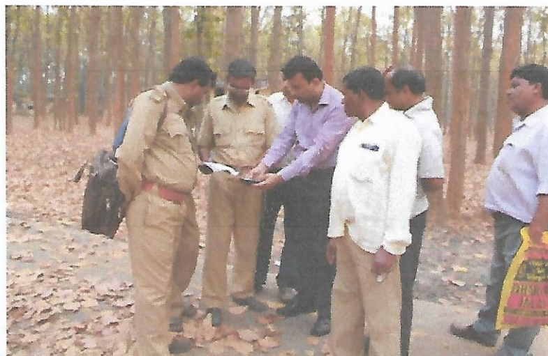
Field Session of GPS Training at Bishnupur