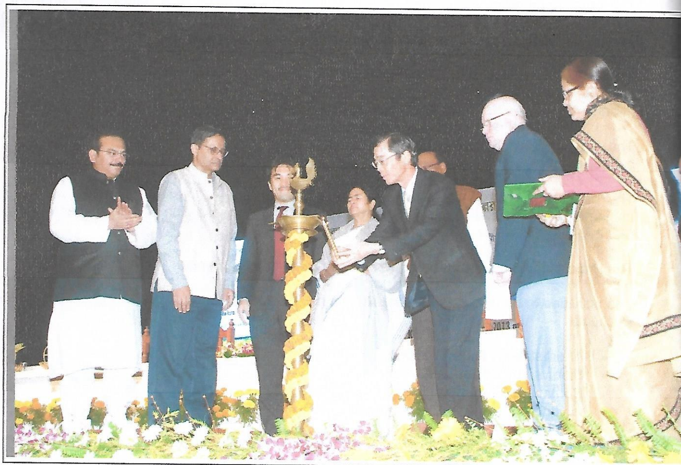
Formal launching of the West Bengal Forest & Biodiversity Conservation Project by the Honorable CM of West Bengal

Various stakeholders in the political and administrative setup of the state and also the non-government stakeholders attended the programme. All heads of Divisional Management Units (DMUs), Field Management Units (FMUs) and representatives of Forest Protection Committees (FPCs) and Eco-development Committees (EDCs) attended for the programme. About 350 participants attended the programme held at the Auditorium of Science City.