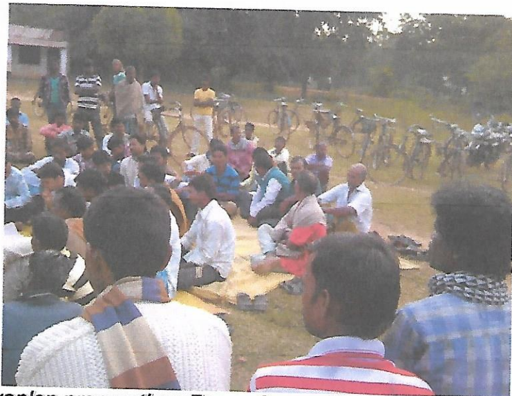
Microplan preparation: Focus Group Discussion in progress