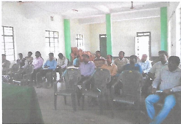
Class Room Session of GPS Training at Hizli