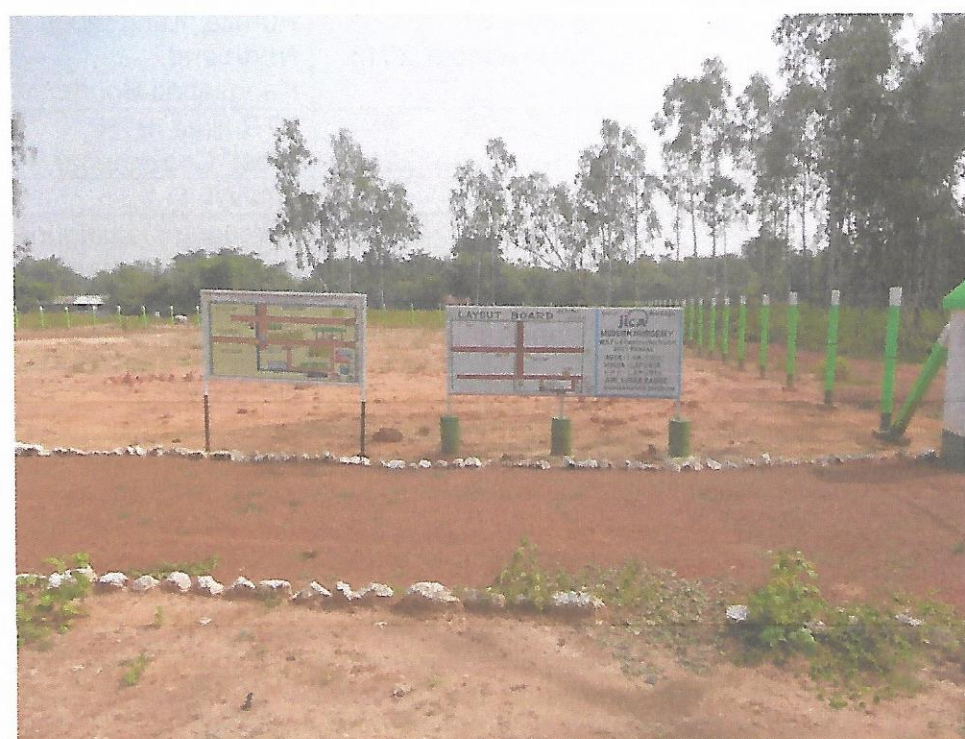
Different stages of development of Central Nursery at Amlagora, Rupnarayan DMU